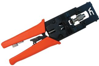
Compression/Crimping Tool 078-1018