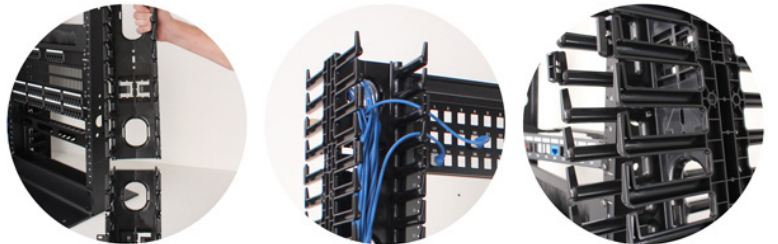
■ Connect sections together ■ Covers are included ■ Suitable for copper & fiber